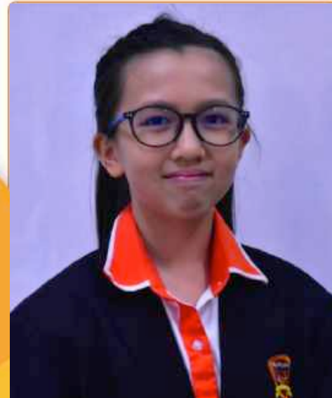
Foo De Mi