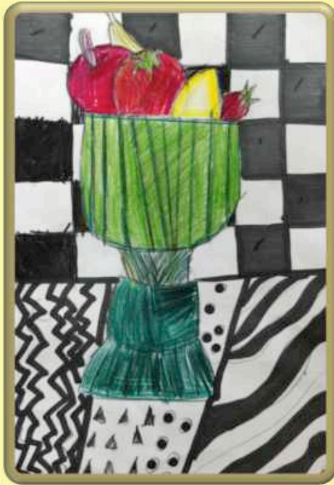
Annabel Aw Qiao Xuan

Students learned how to draw pictures with a pattern background. Students were able to apply contrasting drawing techniques and colour schemes for the foreground images.