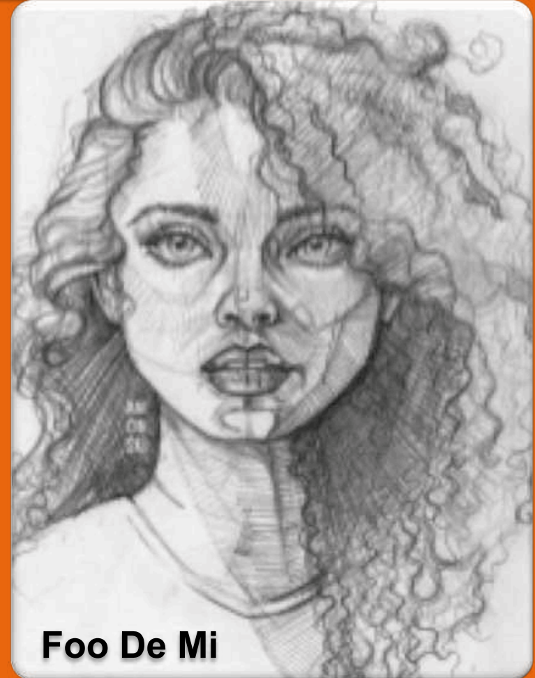
Foo De Mi