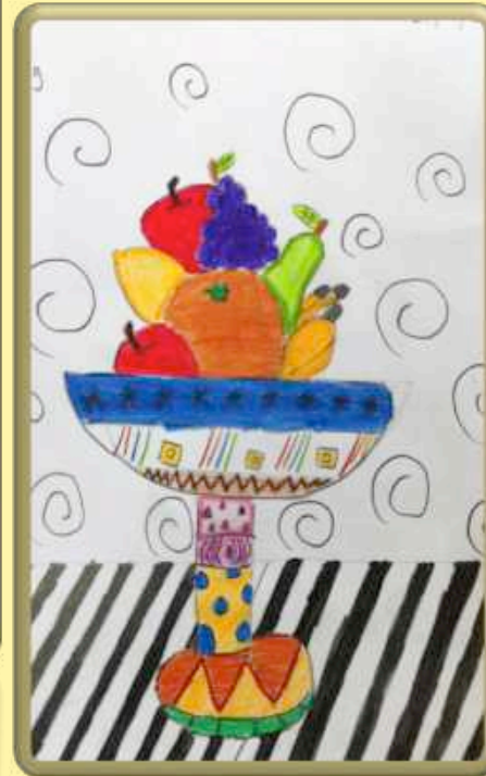
Pang Nuo Yang